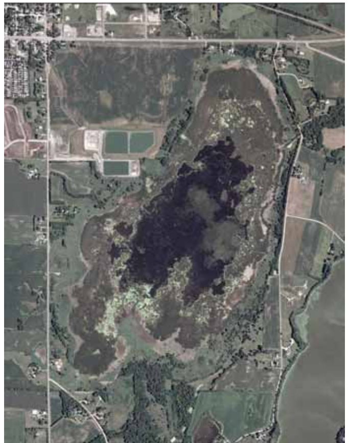
Table 4. Plant IBI assessment results from Woodland WMA.

This wetland was monitored in 2002 and 2004 as part of the 2002 permit review process for the proposed expansion of the wastewater facility. Only plant monitoring was conducted during this process. Plant IBI scores indicate that this wetland is not supporting its aquatic life designated use (Table 4). This impaired wetland is in the watershed of other water bodies currently on the 303(d) impaired waters list. In fact, the small unnamed creek (07010204-527) originating at the outlet of this wetland is currently listed for low dissolved oxygen (see topo map). This small creek is a tributary of the North Fork of the Crow River which is listed for low dissolved oxygen and temperature exceedances.