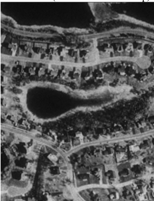
1991 (before water level drop)