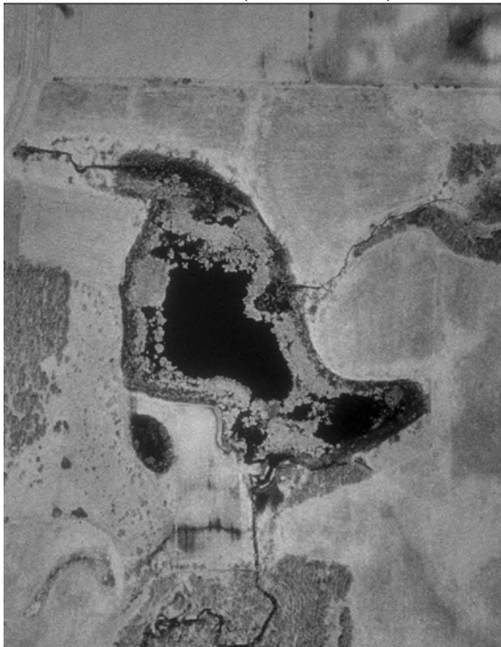
1991 (before berm)